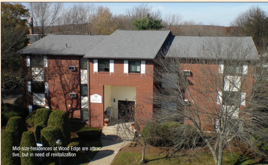
Mid-size residences at Wood Edge are attractive, but in need of revitalization

Perhaps an easier way to grasp the value Kelly's brings to community revitalization is to imagine a master